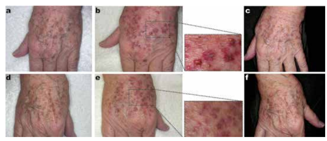
Figure 2 (A) and (D) Baseline, pigmented lesions on the dorsum of the hands in a 79 year-old female, upper row treated with 532 nm (1.8) mm, 1.8 J/cm<sup>2</sup>) and lower with 660nm RuVY Touch (2mm, 2.6 J/ cm2). (B) and (E) 5 days post-Tx, unsightly damage with erythema is more visible on the 532 nm-treated hand, particularly when comparing the magnified views in the insets. (C) and (F) 24 days post-Tx, the clearance is comparable between the two hands, with the 532 nm lesions a little more erythematous

SPECTRA XT extends the capability of the clinician with its two new wavelengths, 595 nm and 660 nm, to deal more safely and effectively with a variety of inflammatory and pigmented targets. The 300 µs quasi long-pulsed mode deliverable at 45 J over 1 second offers flexible and