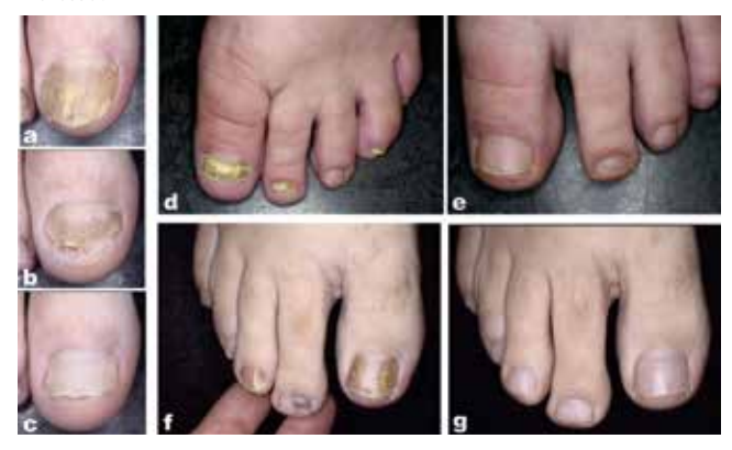
Figure 4 (A) A diseased nail, (B) is clipped back as much as possible, and the laser applied. (C) The fungal infection is inactivated, and normal nail growth gradually replaces the old nail. (D, F): Example of onychomycosis involving multiple toenails. (E. G): The results following treatment of infected nails with the SPECTRA XT showing complete regrowth of new nails, and no sign of recurrence.